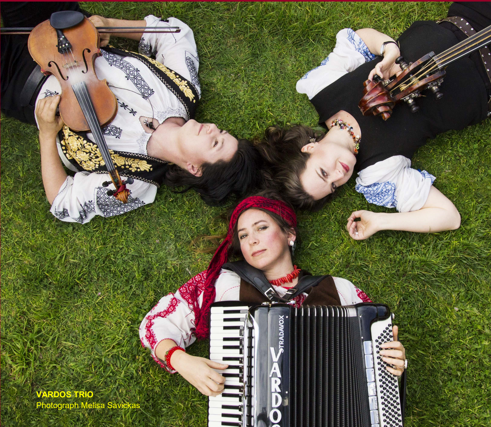
VARDOS TRIO

12th Annual Windfire Festival of Music March 11 to 20